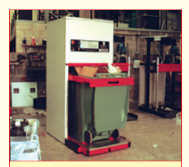
2. Load waste into the bin & press start button.

Simply wheel the bin onto the machine ensuring the lid is open, & pull down locating arm.