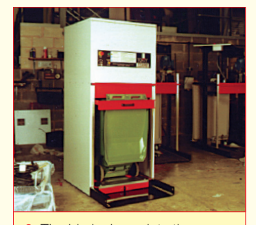
The bin is drawn into the machine, waste is compacted and the bin is automatically returned for reloading.