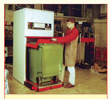
4. Orange light indicates bin is full. Simply remove bin & replace with an empty one.